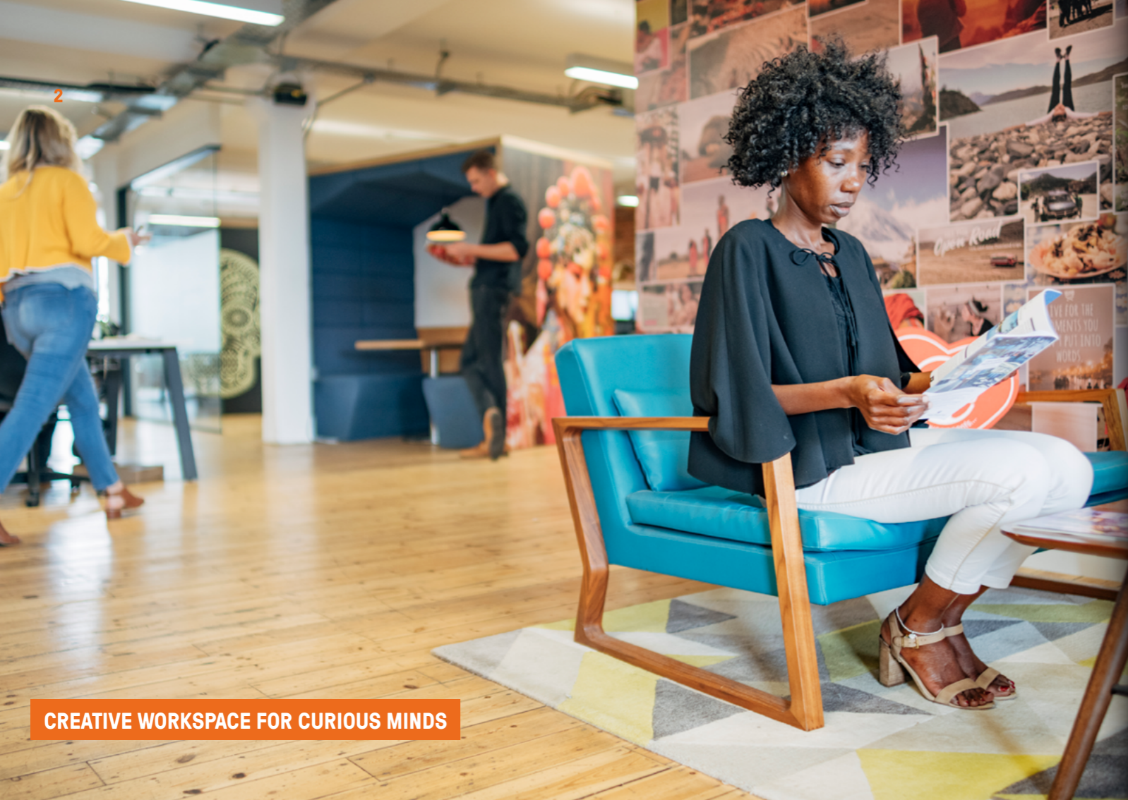
CREATIVE WORKSPACE FOR CURIOUS MINDS